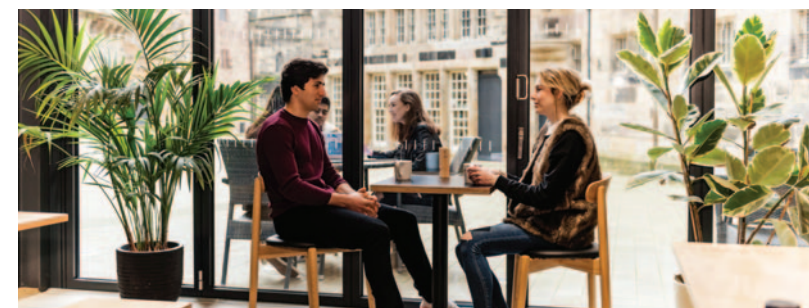
The Castle Café – Lancaster Castle