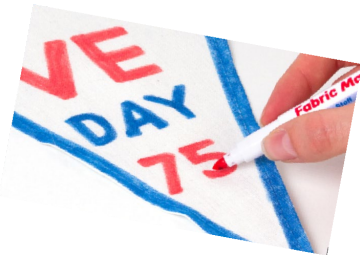
Make your own flag