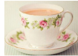
Design your own teacup