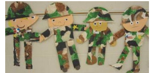
Create a picture of a soldier