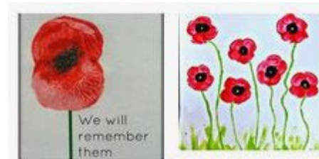
Create a poppy picture