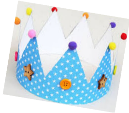
Make a crown