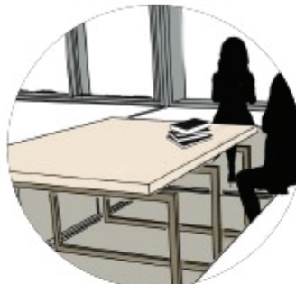
15:00 PM Collaborate in the Studio