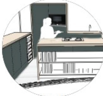
11:00 AM Answer Calls and Emails