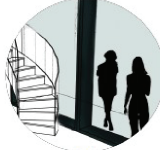
12:00 AM Working Lunch Break