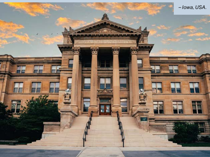
– Iowa, USA.

We also offer vacation travel opportunities to all students, regardless of degree scheme. These are typically short trips (up to 3 weeks) that include meeting local students and businesses as well as academic study and cultural discovery. Past destinations have included China, Ghana, Malaysia and Switzerland. Find out more: www.lancaster.ac.uk/global-experiences