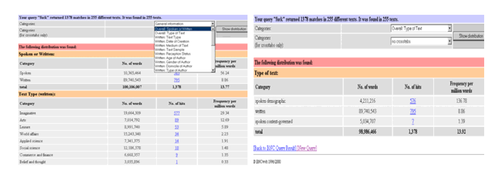
Fig. 20.7 Show distribution

As noted in unit 2.4, the BNC contains orthographically transcribed spoken language using two different sampling regimes: demographically determined and context-governed. To get the word numbers and frequencies of FUCK for the two types of spoken language, click on the down arrow on the right side of General information in step 6, select Overall: Type of text and press the Show distribution button, as shown in Fig. 20.7. You will be taken to the distribution window giving the word number, number of hits (RF) and frequency per million words (NF) for three types of text: spoken demographic, written and spoken context-governed (Fig. 20.8). Record the word numbers and frequencies for the two types of spoken text. Do the same for search strings fucked , fucks , fucking | fuckin , fucker | fuckers , and fuck | fucked | fucks | fucking || fuckin || fucker || fuckers as in step 7. Your results should match those in Table 20.2.