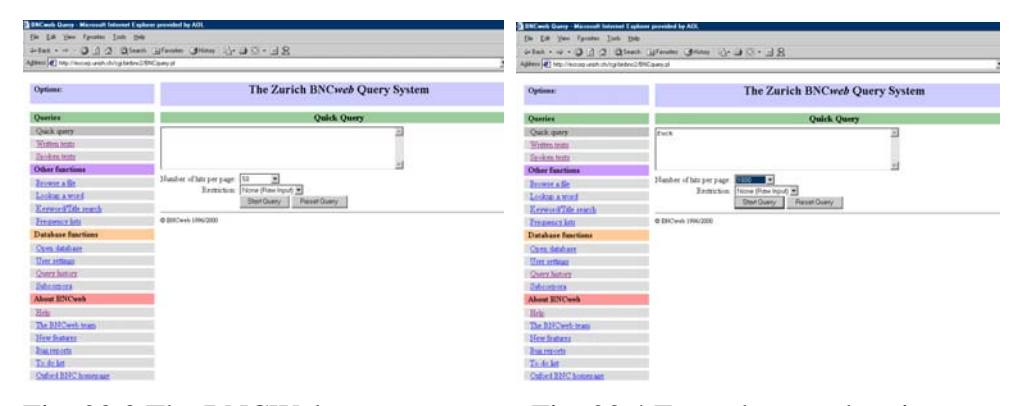
Fig. 20.3 The BNCWeb query system Fig. 20.4 Enter the search string