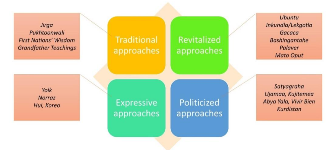
Figure 1. Categories of Indigenous approaches – a tentative Western systematization of their application

conflict, including by vocalizing one's emotions. As such they may be the kind of indigenous discourses that, by the West, is perceived the least competitive to its own dominant discourse on conflict transformation ( Error! Reference source not found. ).