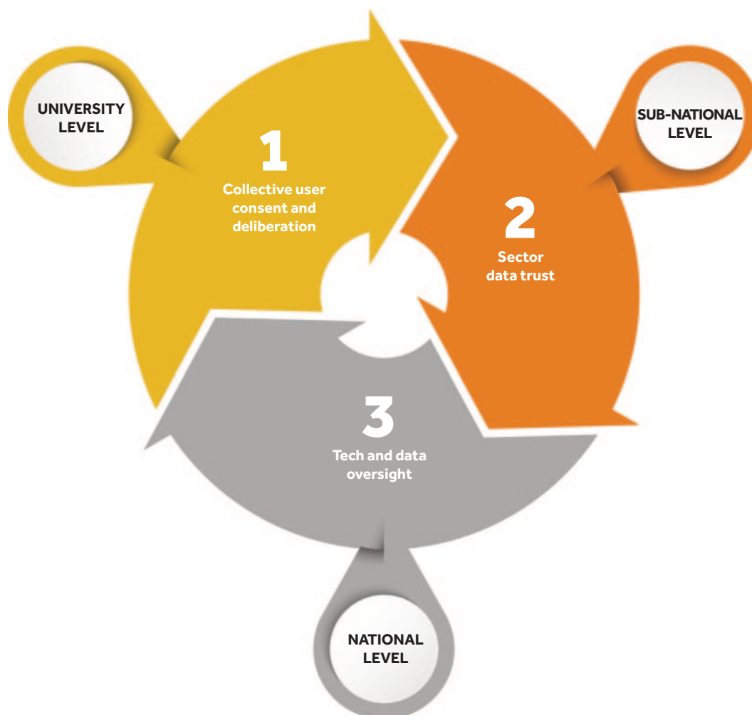
Figure 2. Three dimensions of technology and data governance in higher education

These proposals for discussion are organised into three dimensions at different levels. Together, they represent a holistic and cross-cutting intervention in technology and data governance to support individual rights, institutional progress, and fair market competition and innovation.